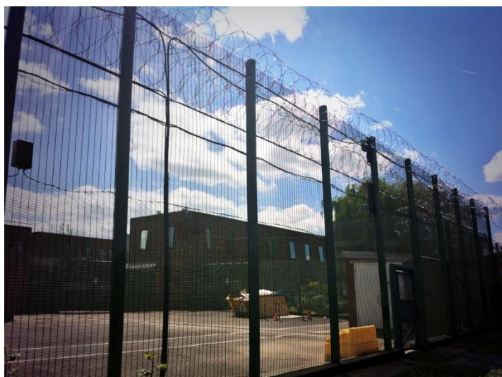
Campsfield House Immigration Removal Centre

6. Need more help? Want to chat? - If you are going to use this guide, we would like to hear from you. Drop us a line at detentionforum@gmail.com and let us know whether you have found it useful. If you want to have a chat about the guide, please also contact us.